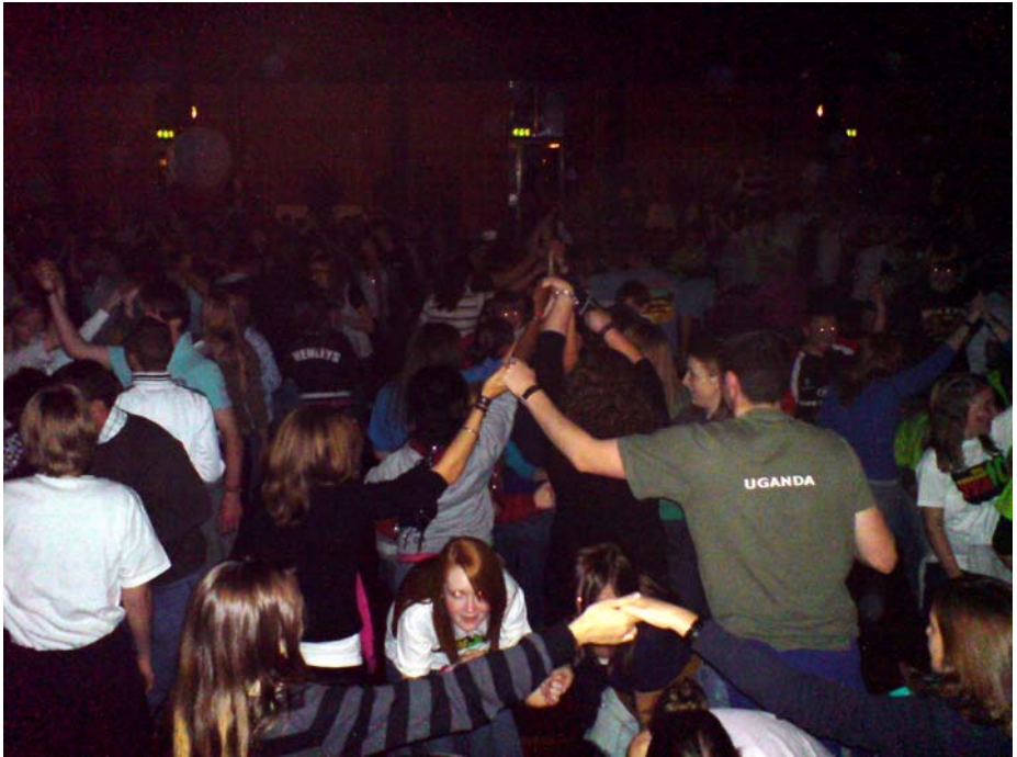
Scottish Dancing – MAD style!

The next morning and the 7:30am alarm call was quickly upon us. Morning at the university consisted of two sets of seminars. The first set were a choice called 'How to..'.